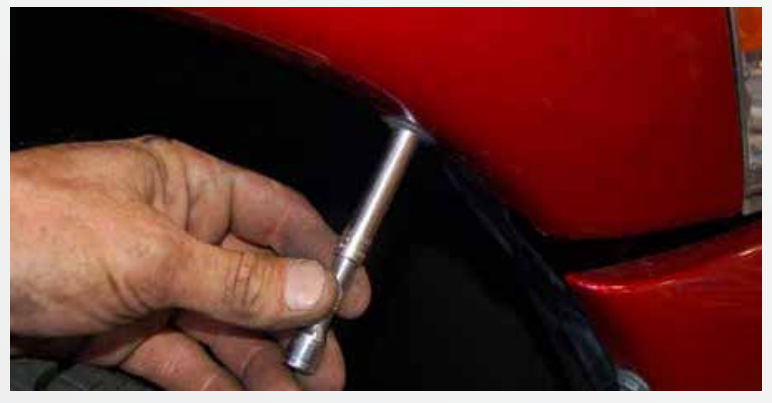
Remove the seven (7) inner fender screws from under the fender.