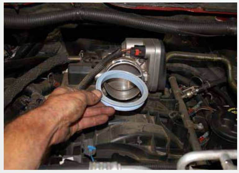
Loosen the two bolts that hold the plenum to the intake manifold. Remove plenum. Remove rubber seal from throttle body.