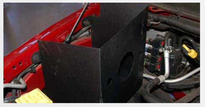
Install the BBK air filter shield inplace on inner fender. Secure with the stock (2) bolts.