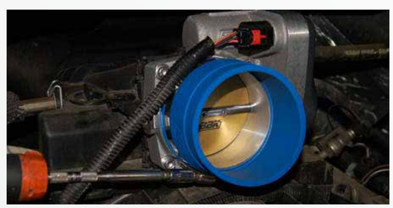
Install the supplied blue rubber hose coupler onto the throttle body. Install the clamps and Tighten the one on the throttle body.