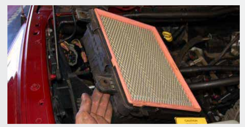
Loosen the hose clamp on the inlet hose where it connects to the decorative plenum. Release clamps on air-box lid and remove lid and inlet hose. Remove air-box bottom and Filter.