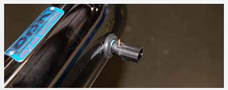
Install the supplied black rubber grommet in the chrome inlet tube. Install the Intake Air Temp (IAT) sensor that you removed from the stock plenum in STEP 2, into the grommet.