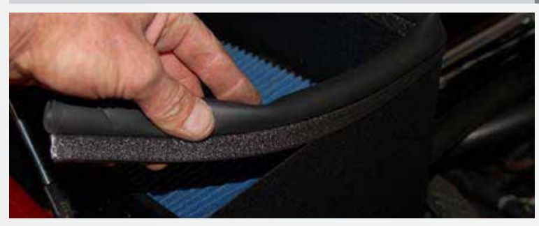
Install sponge seal to top of air filter shield. Trim off extra.