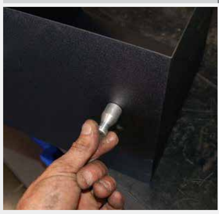
Install the supplied aluminum pins to the bottom of the air shield using the supplied screws.