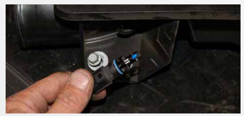
Unplug Intake Air Temp Sensor. Its located in the front of the decorative plenum box, just to the right of the inlet hose connection. Turn sensor to the left to unlock and remove.